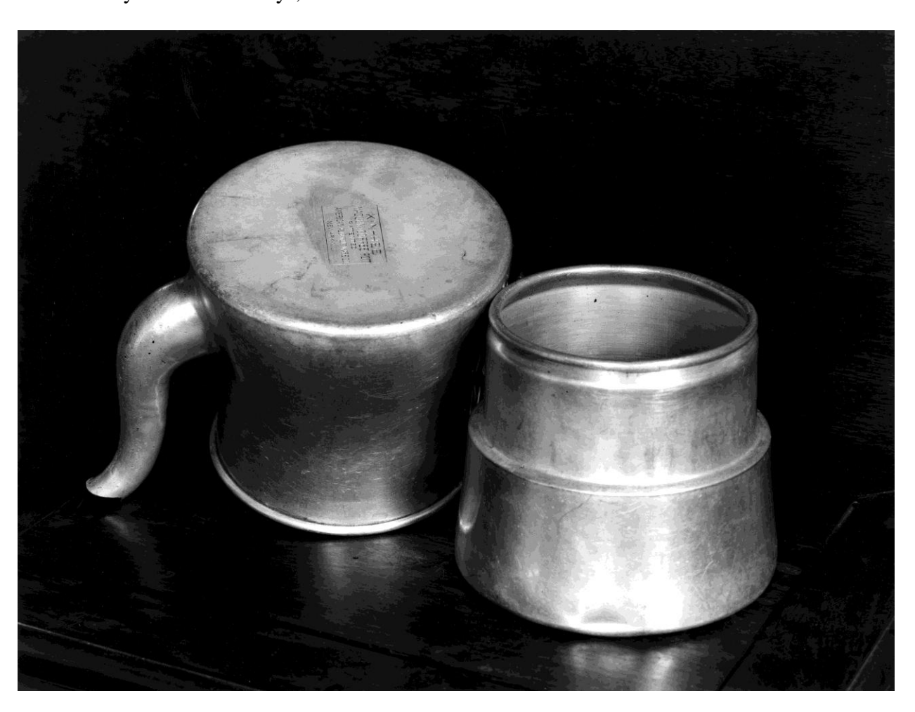
Coffee Pot, 1938.

"I remember that coffee pot well -- and since I worked for her around 1970 (spotting prints as a teenager) Imogen obviously had this coffee pot around a while. It surely captured her eye, and with her very economical ways, she used it for decades!"